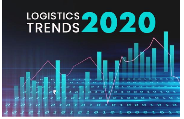
The digitalization of the industry has impacted various sectors, and logistics is no exception. Digital literacy and consumer awareness play a crucial role in shaping personalized purchasing decisions. The integration of digitalization in logistics not only significantly reduces procurement and supply chain costs but also enhances overall revenues. It empowers organizations to make better and faster decisions, fostering seamless collaboration with partners.

Supply chain visibility is a key benefit of digitalization. Knowing the real-time location of goods is essential for meeting customer demands. Reports indicate that 71% of supply chain professionals believe that a lack of visibility adversely affects their business. Endto-end visibility is crucial for responding to unexpected events and making informed decisions. It also facilitates better collaboration with partners, making information visible for improved business processes, decisionmaking, and forecasting. Logistics safety has become a paramount concern in an era of increased connectivity and data storage on the cloud. The rise in cybersecurity issues has led companies to prioritize the safety of consumer data. Logistics providers are now focusing on offering secure logistics solutions to address these concerns.