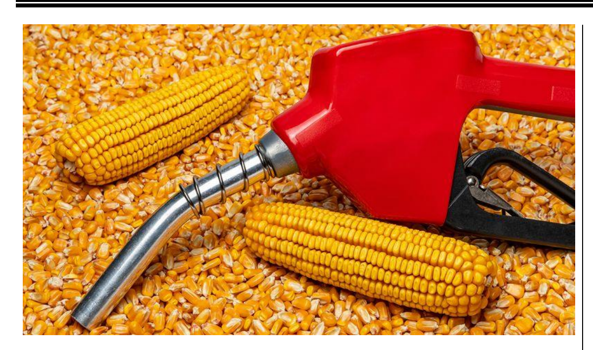
Source: https://www.cbnme.com/magazines/logistics-news-me-march-2020/, March 5, 2020